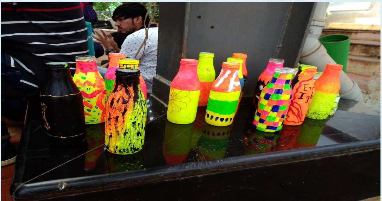
Artwork created by students