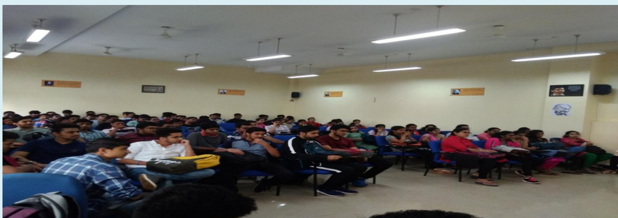
Students Ice Breaking Session