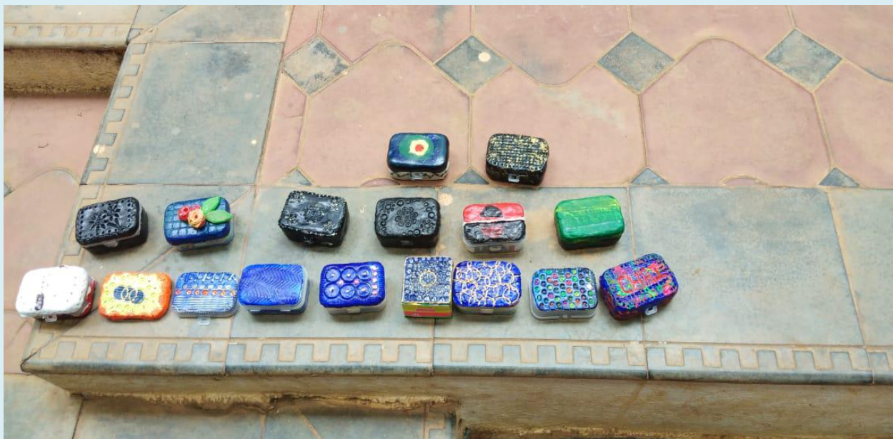
Art work done by the students