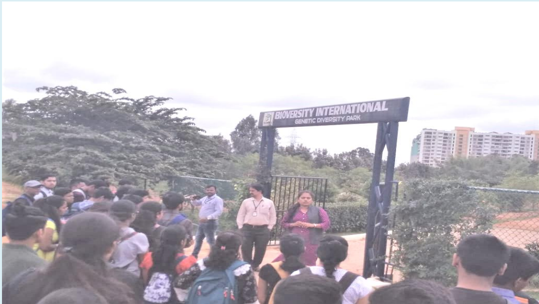
Students at the Genetic Diversity Park