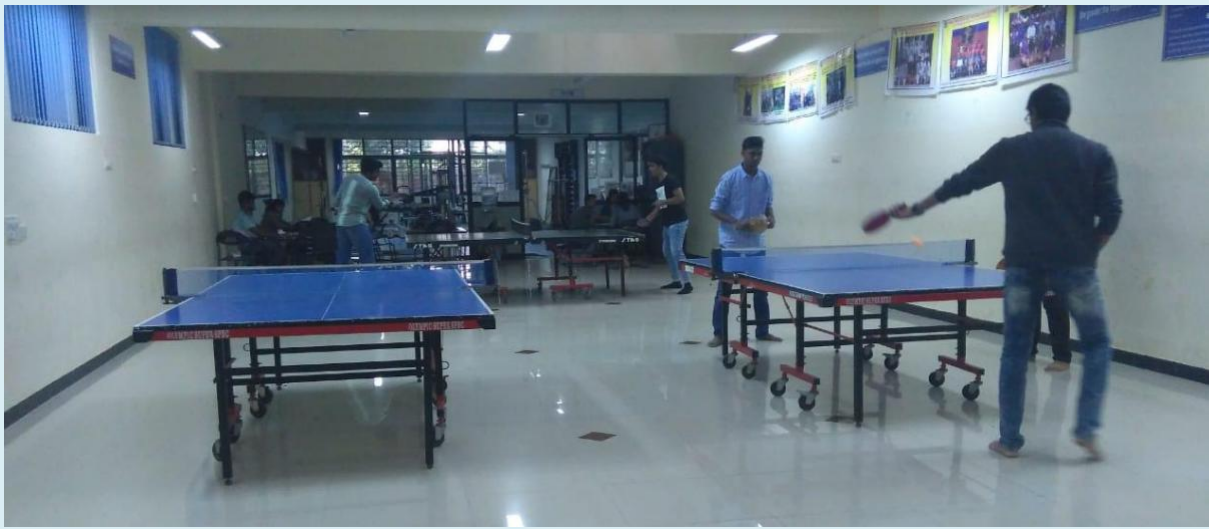
Students playing Indoor Games