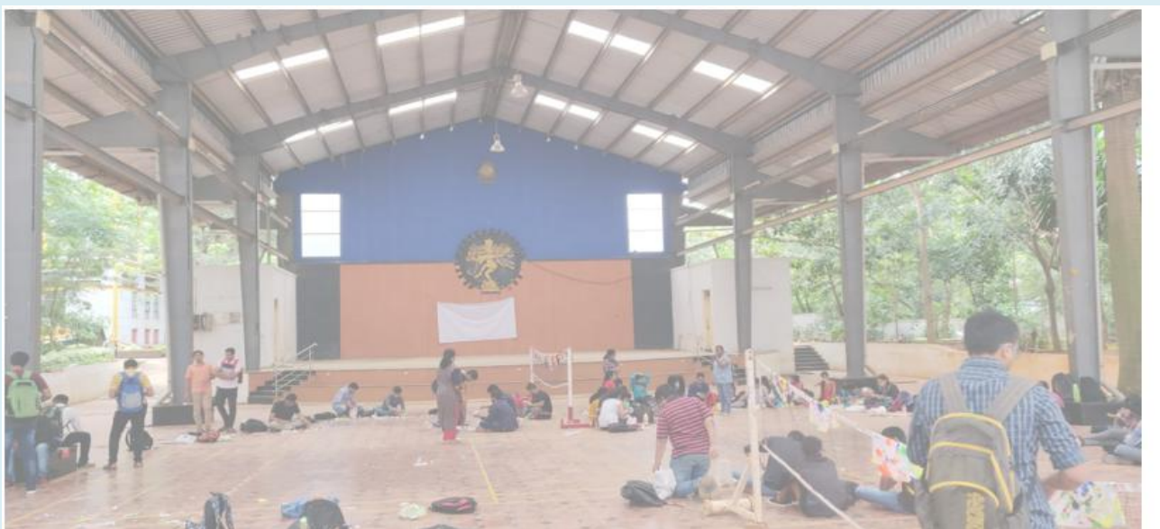
Students divided into groups for the session