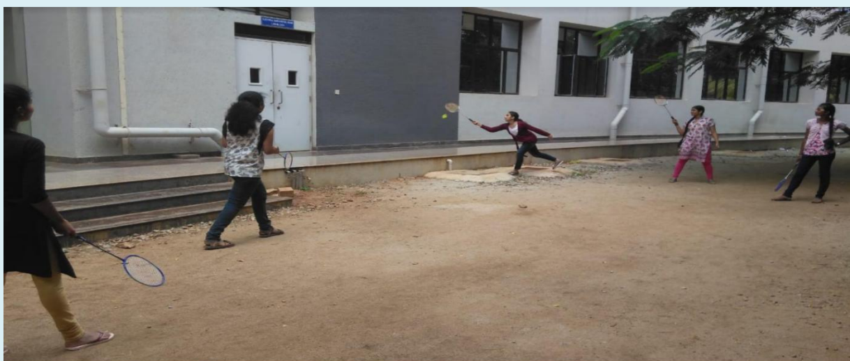
Students playing Outdoor Games