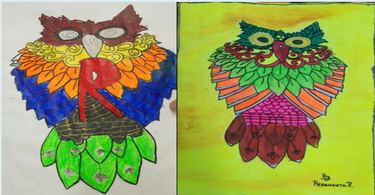
Art work done by the students

Indoor and Outdoor games were carried out in sports session.