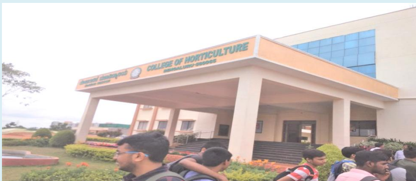
GKVK Campus - The College of Horticulture