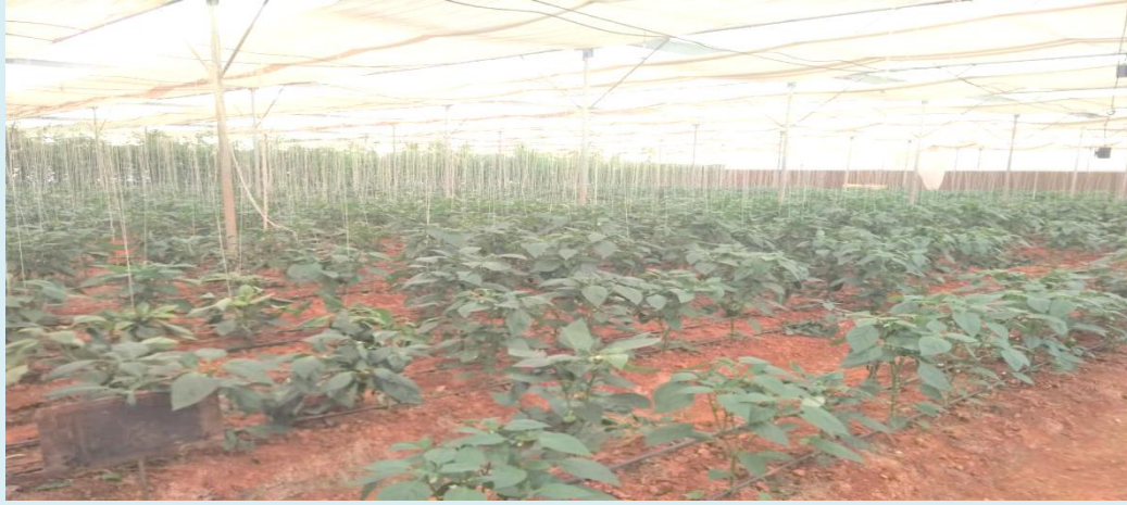
Vertical Harvesting of Capsicum