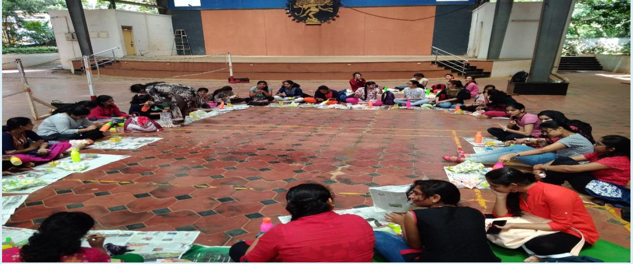
Students painting glass bottles