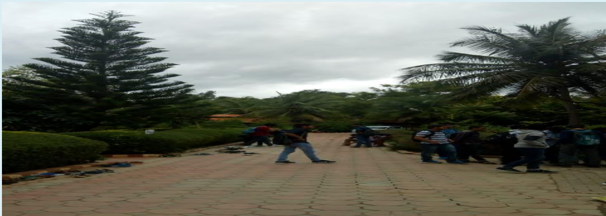
Students entering the Ashram