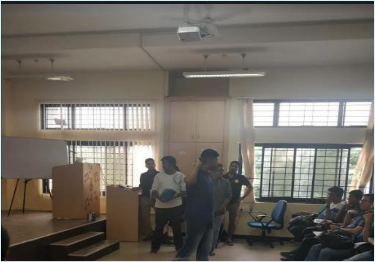
3 rd Year Seniors conducting some students