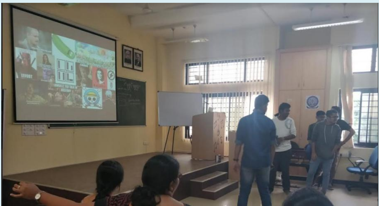
3 rd Year Seniors conducting some students

3 rd semester students arranged welcome party to the fresher's and they conducted events for fun. Arranged for cake cutting and first year students had fun.