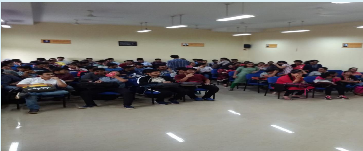
Ice breaking Session