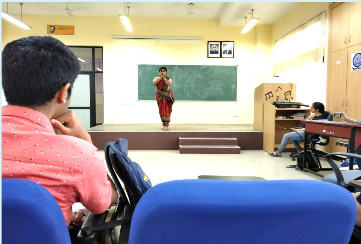
A Senior Student performing the different verses of the Mahabharata