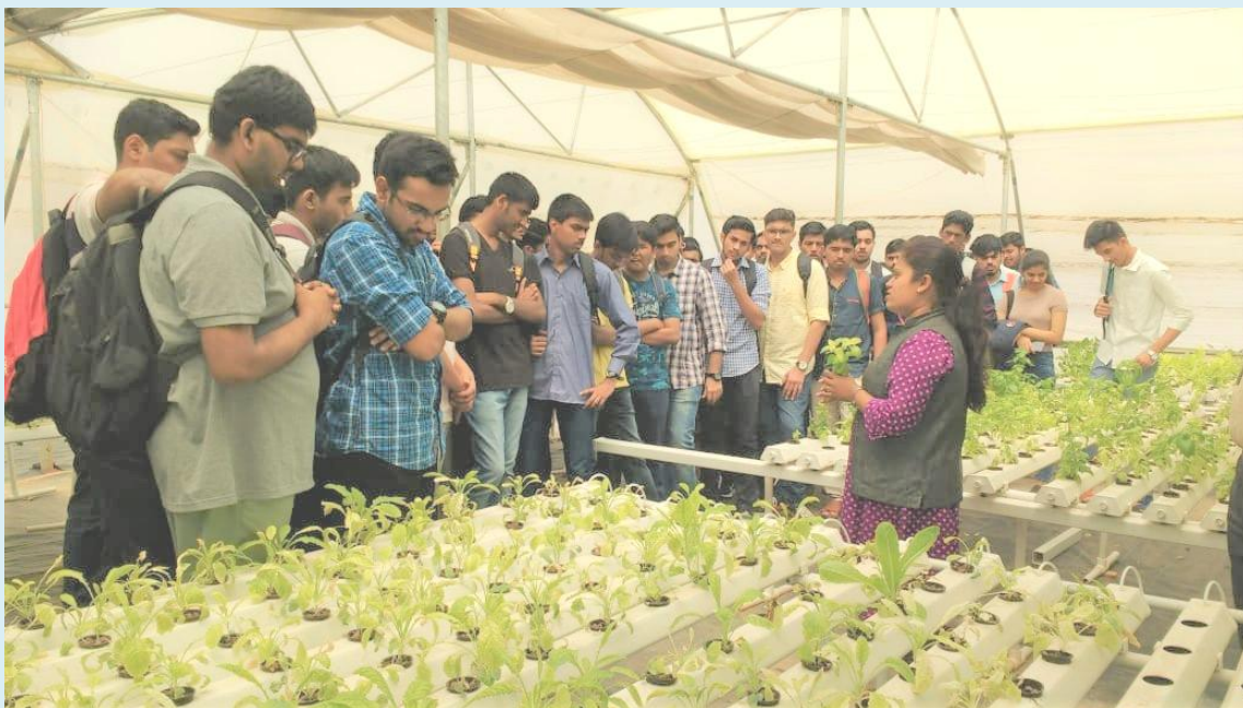
Students understanding the techniques of Hydroponics