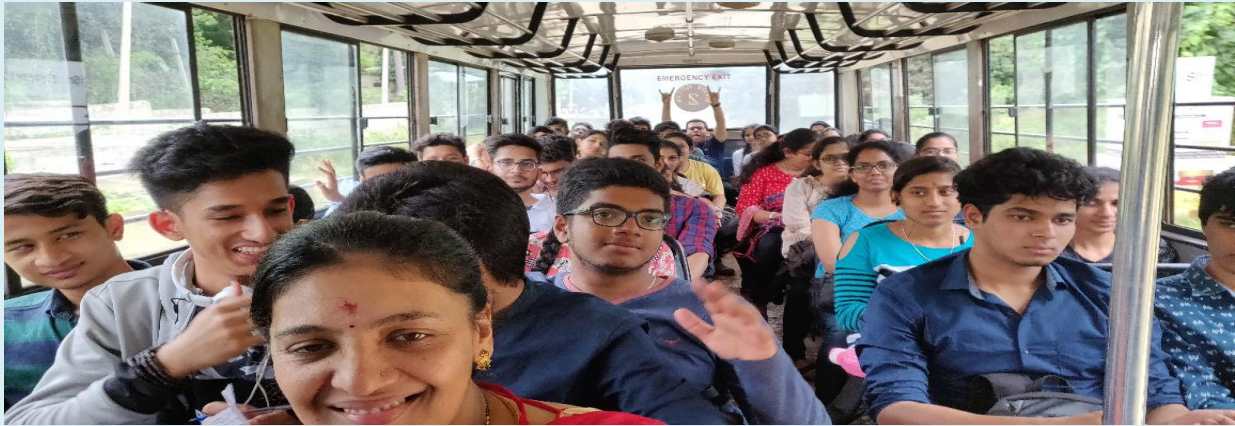
Student travelling to Ravi Shankar Ashram in college bus